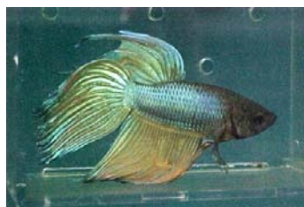
Tropical Gold Fighter

Siamese fighters originate from areas of South East Asia. Most fancy fighters today are imported from Thailand. The males are best kept by themselves in small volumes of water of at least 1.5 litres. In these small environments, females should not be introduced as fighting may erupt.