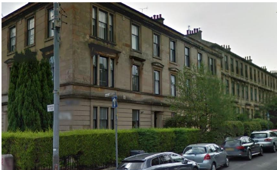
Figure 1: 1 Elgin Terrace today.

and these addresses are confirmed by entries in Glasgow's rate books.