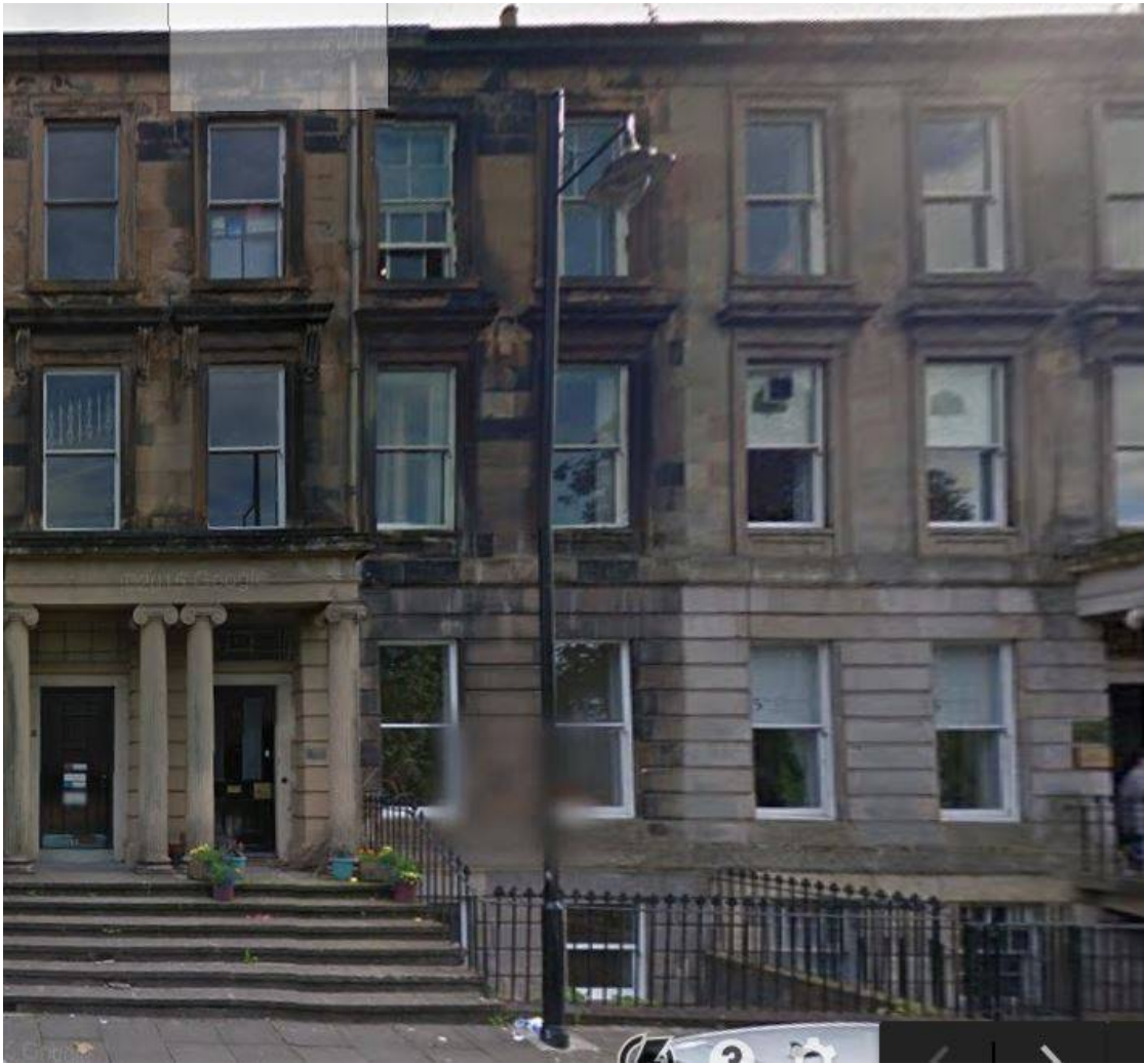
Figure 3: 14 Royal Terrace today.