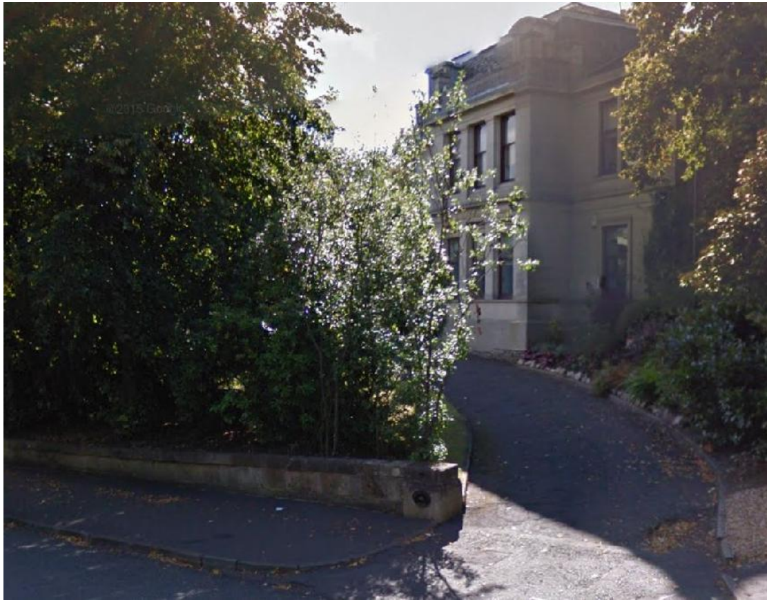
Figure 4: Montgomery House today.