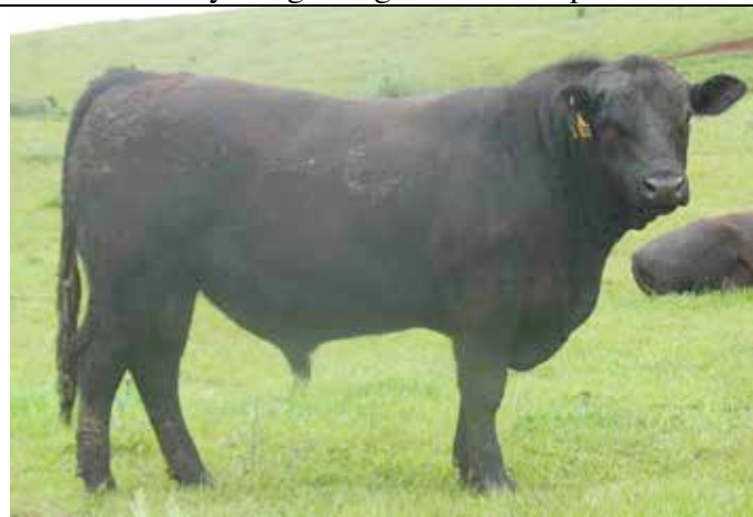
Dunlop park Gordon G34 (E31 son) Used as a heifer bull due to his low birth weight

You can tell by the green grass that the photos were taken in November ☺