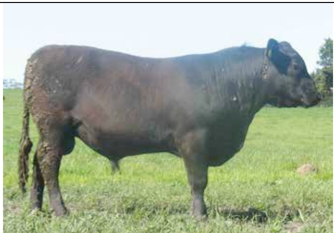
Dunlop Park Galahad G10 (Zulu son)

Catalogues will be available mid February and can also be viewed on our web-site http://www.dunloppark.iinet.net.au