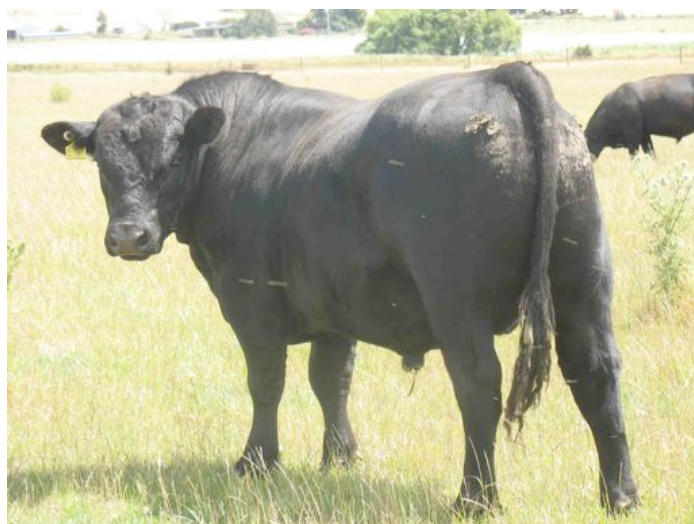
Dunlop Park Equerri E5