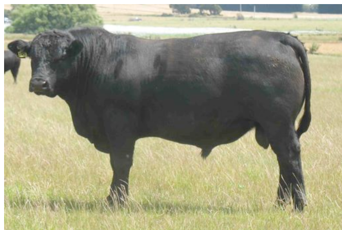
Dunlop Park Earl E30

Netherton Lord Jordan UKI542697200402 The first progeny of this impressive Scottish bull will be available at the sale.