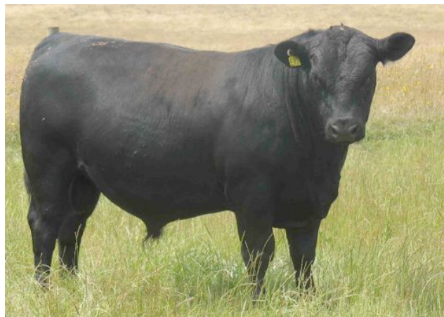
Dunlop Park Excelsor E10

This son of Netherton Lord Jordan will be available at the sale. He recorded our best ever ultrasound scan EMA