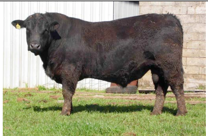
Dunlop Park Hamish H72 as a 2 year old bull