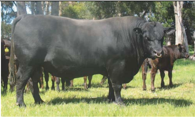
Dunlop Park Emperor E18

Dunlop Park Jenolan J122. A son of our top priced bull in 2013 this line is breeding well at Dunlop Park. His brother will have progeny in our 2018 sale.