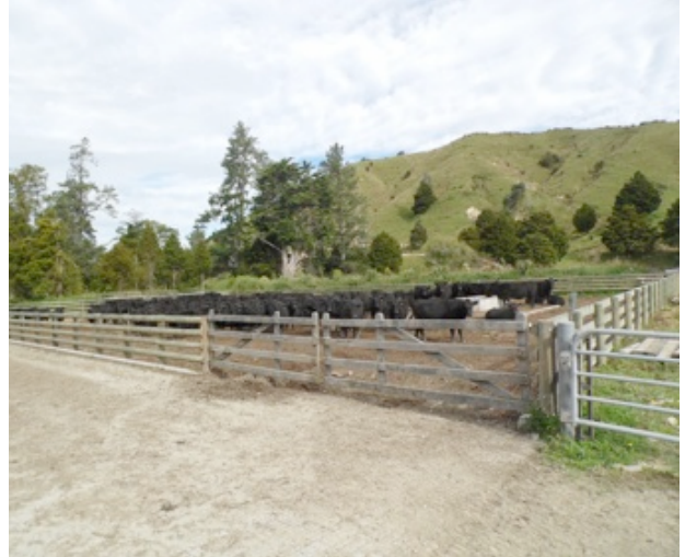
A new feature at Waimata is a feedlot where the breeding cows are kept through winter. This has enabled the breeding herd to be increased from 350 to 1000 cows