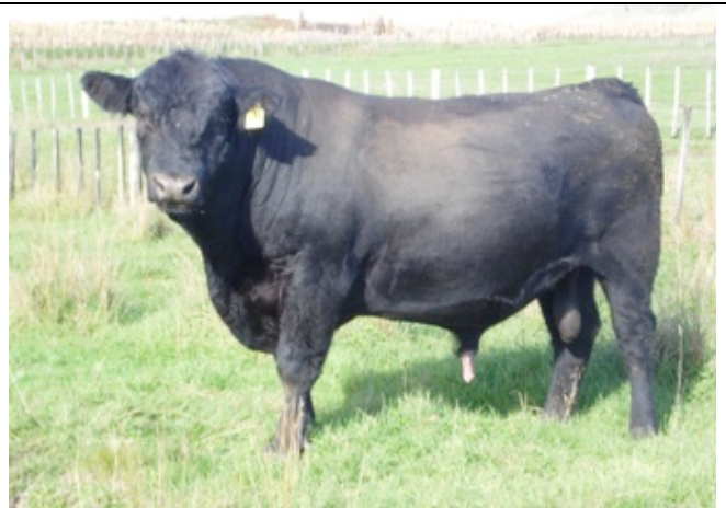
A typical Waimata bull, Waimata 299