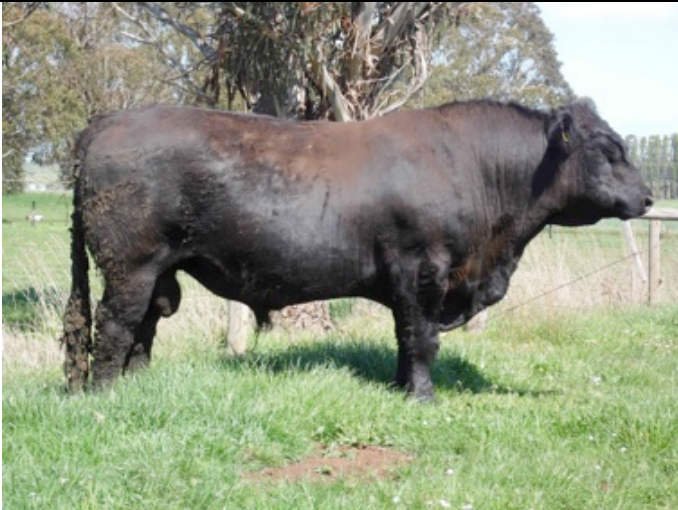
Dunlop Park Halkirk H32 A son of leading British AI sire Aynho Rossiter Eric. Halkirk is in the top 10% for both feed efficiency EBV's.

Stud Sires: Dunlop Park Falcon F7 Waimata Sky High M228 Dunlop Park Edinburgh E31 Dunlop Park Emperor E18 Dunlop Park Halkirk H32