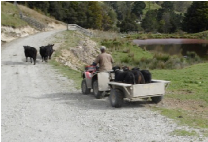
The dogs have it easy at Waimata