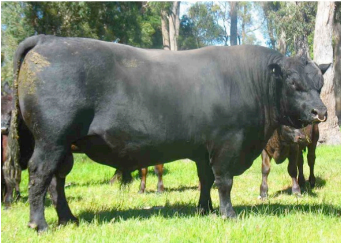
Dunlop Park Emperor E18 A son of UK sire Netherton Lord Jordan. His daughters are very impressive.