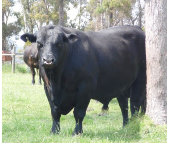
Dunlop Park Edinburgh E18 A son of Netherton Lord Jordan, his sons have scale and a lovely temperament.

Catalogues: Sale Catalogues are due out in late February. If you would like one and are not on our catalogue mailing list (i.e. you didn't receive a catalogue in 2015) please either send us your name and address, phone (03 64 269 239 or 0400 950 872) or e-mail: bstewart1@iinet.net.au