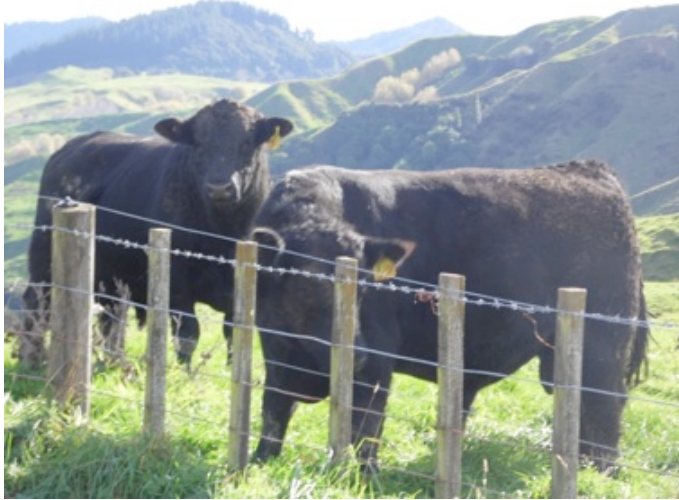
This picture gives you an idea of both the cattle and the country at Waimata

In 2014 Dorothy and I were fortunate to visit the Waimata Angus Stud and spend the day with Pat and Evelyn Watson. Situated in the Waimata Valley west of Gisborne Waimata is a herd of classic New Zealand grassfed Angus with no North American Blood. Several Waimata bulls have been used extensively in Australia, Zulu 689 of Waimata and Waimata E230. Waimata bulls have also been used in North America; E230 sired Schaff's S A V Worldwide now a leading AI sire in North America.