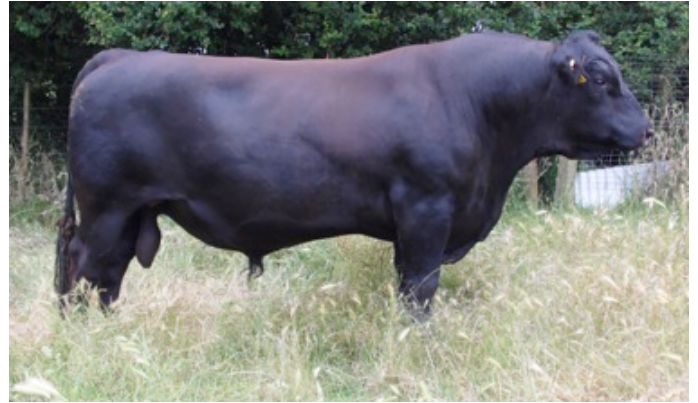
Dunlop Park Falcon F7 A son of Taloozy Zulu Z98. His sons have length and muscling.