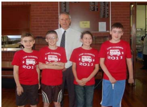
Belmay Satellite Class Camp Cunderdin 30 Nov - 2 Dec