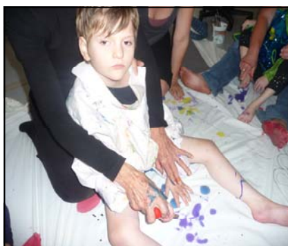
Banksia and Redgum