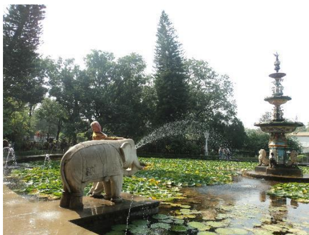
Gardens of the Maidens

Rotary Club visit details being finalised.