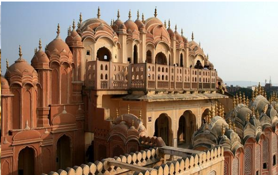
Palace of Winds

This morning catch a short flight to Udaipur and check in at hotel. This evening enjoy a boat ride on Lake Pichola.