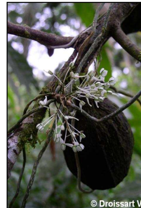
Microcoelia konduensis (De Wild.) Summerh Benin, Cameroon, Democratic Republic of Congo,