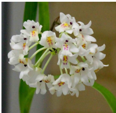
Neobenthamia gracilis