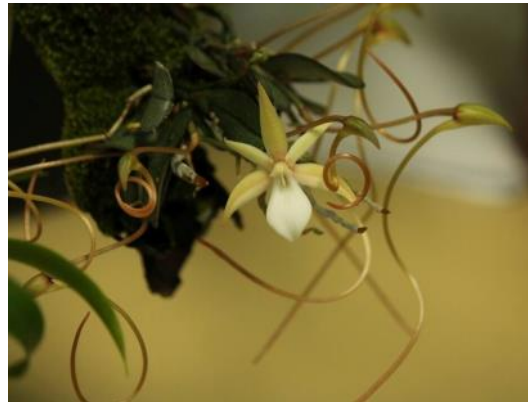
Aerangis fuscata Maxine