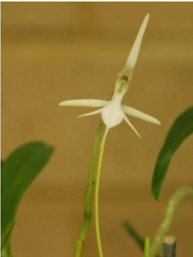
Jumellea walleri Siva