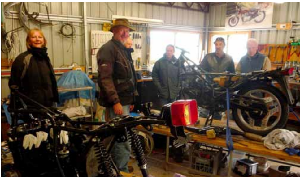
Checking out the V-3 250cc 2-stroke Honda in Les' shed.