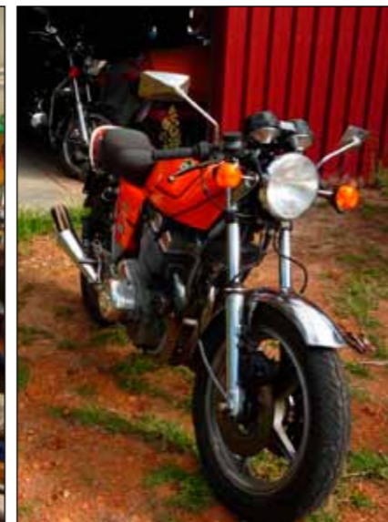
1980 Laverda Jota.

ABOUT 23 people turned up for the Boxwood Hill ride. The weather was absolutely beautiful, blue sky, no wind and a nice temperature. I rode the Moto Guzzi SP 1000 for the first time on a big run, I had only ridden it for a short run around Torbay. Ronnie rode the Yamaha 1100 Special alias "Tip bike"