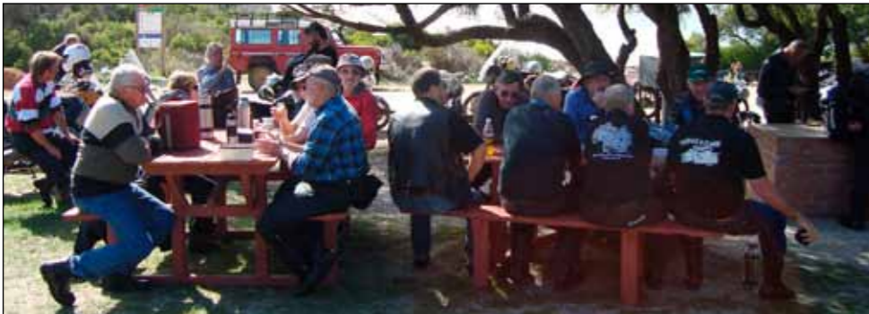
Picnic spot at Parry's Beach.