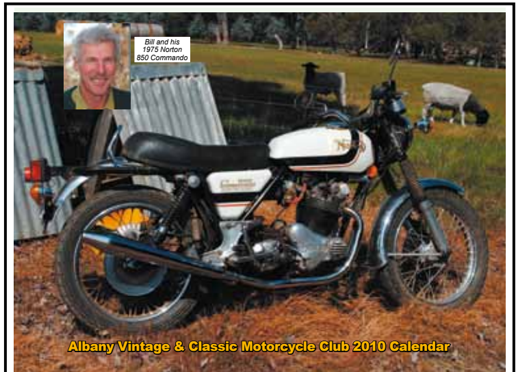
Albany Vintage & Classic Motorcycle Club 2010 Calendar