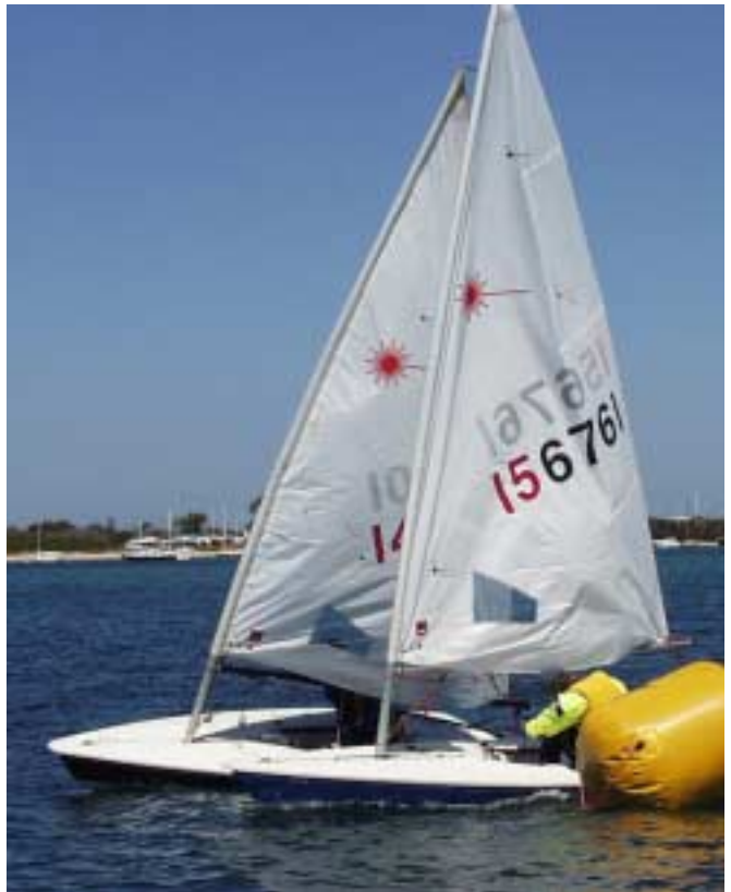
Above - Two young sailors jostle for position at a mark during West Sail 2001.