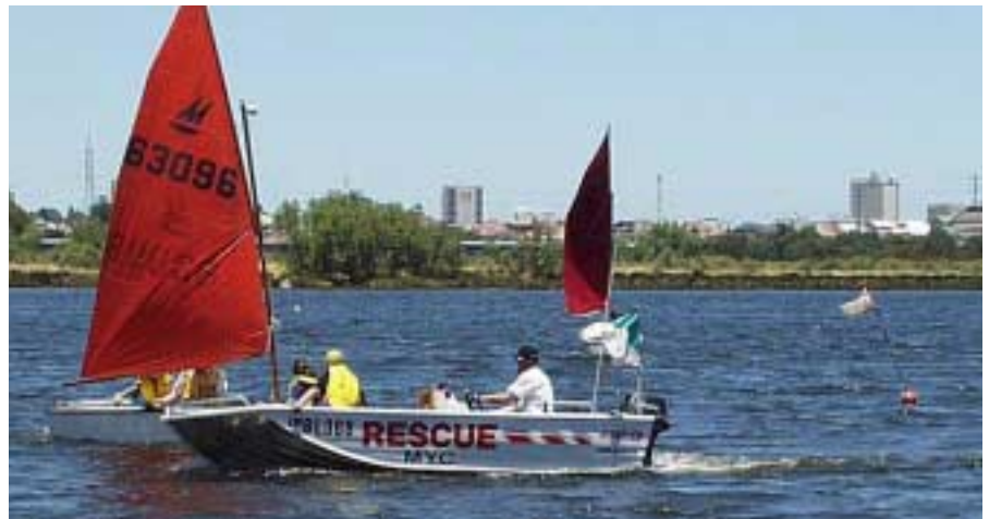
MYC instructors give advice to two keen young Mirror newcomers from the rescue boat