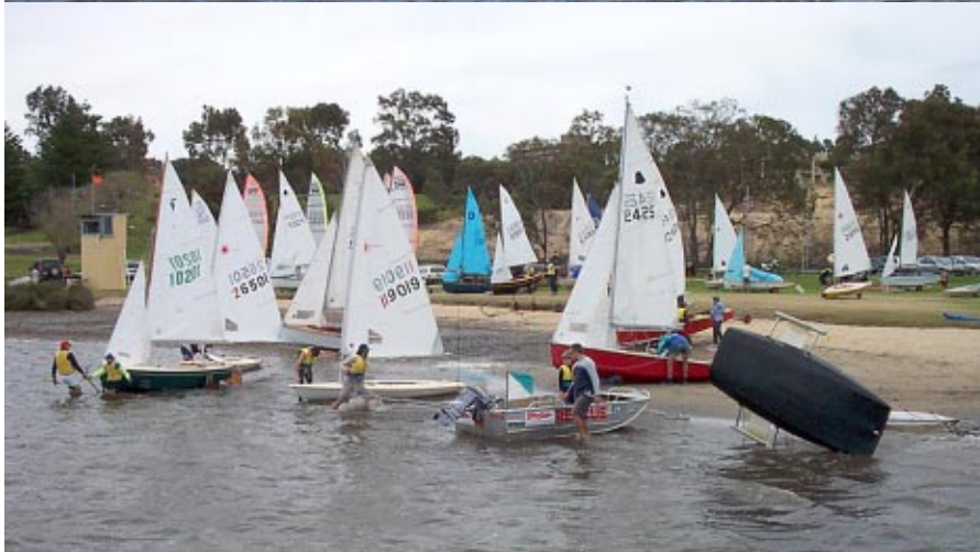
Above and left: Another successful opening day at MYC with large fleets and pleasant breezes.