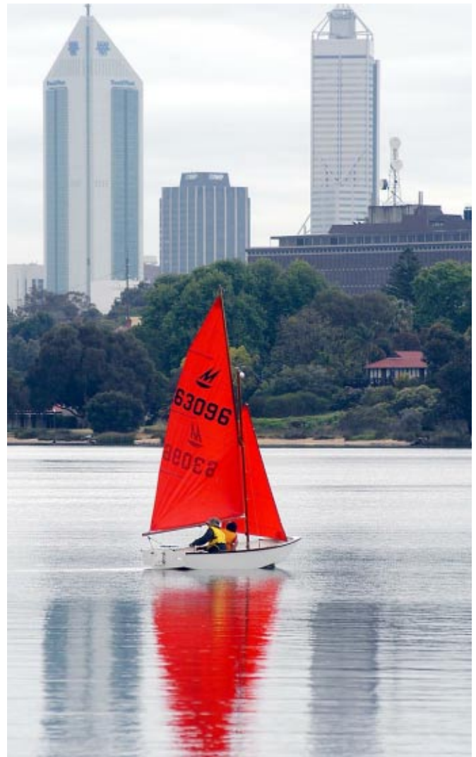
"Mirror Image" - this lovely picture was taken by The Guardian Express and shows one of the MYC Mirrors on a tranquil Sunday morning on the Swan.