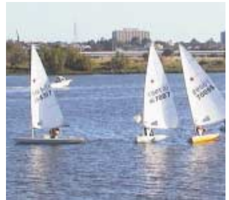
Light winds and close racing were a feature of the last race in the HVAC series.

The last race of the HVAC winter series was a great success – I'm sure that our visitors from downstream were quite amazed at the turnout. Let's keep it that way, starting, of course, with Opening Day on the 15th October, which is also the City of Bayswater Regatta.