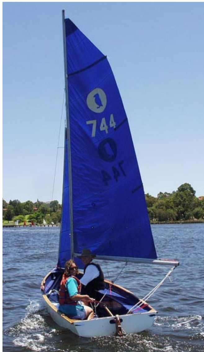
No Pacer news this issue, so here's a pic to remind you all what they look like! Hopefully we'll see a good-sized fleet with ultra-close racing like last year!