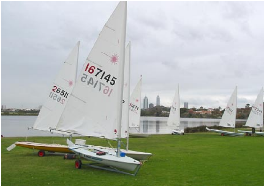
Laser fleet on a cloudy day at MYC – WALA winter series. The winds remained light and fluky all day.